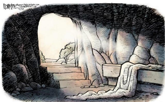
The LIGHT at the END of the TUNNEL

PLEASE BE AWARE TRYBOOKING CONTINUES UNTIL WE ARE ADVISED OTHERWISE. AS YOU KNOW IT CAN BE A VERY SLOW PROCESS AT THE DOOR IF YOU FAIL TO BOOK YOUR SEAT. TO MAKE IT EASIER FOR EVERYONE TAKE ADVANTAGE OF THE OPTIONS AVAILABLE – TAKE A GREEN SHEET FROM THE TABLE AT THE ENTRANCE FOR MORE DETAILED INSTRUCTIONS.