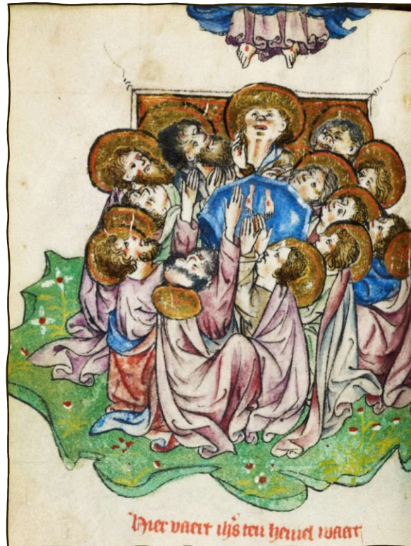
Book of Hours (c. 1420). 'The Ascension'. British Library Additional MS 50005 f. 141v.

Are we simply staring to the sanctuary with eyes that see no further? Are we gazing at the mountainous altar blankly? Perhaps the greeting of the two men in white or the commission of Jesus can be heard by us afresh today.